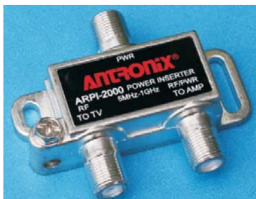
Optional Power Inserter

Approvals include UL, CE, FCC and the EMC requirements of FCC part 15.