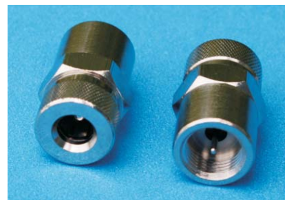
Optional "F" Connector Adapter